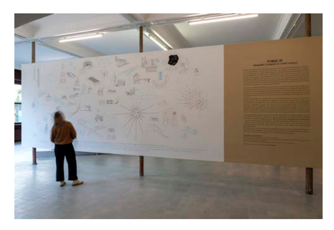
Map Power Up. Technical Imaginaries and Social Utopias, graphic design Charlotte Vinouze, 2024. Exhibition view Power Up. Technical Imaginaries and Social Utopias at Le Grand Café – contemporary art centre, Saint-Nazaire, France, 2024.

These images are available in high-definition on request. Thank you for respecting and mentioning the caption and photo credit when reproducing them.